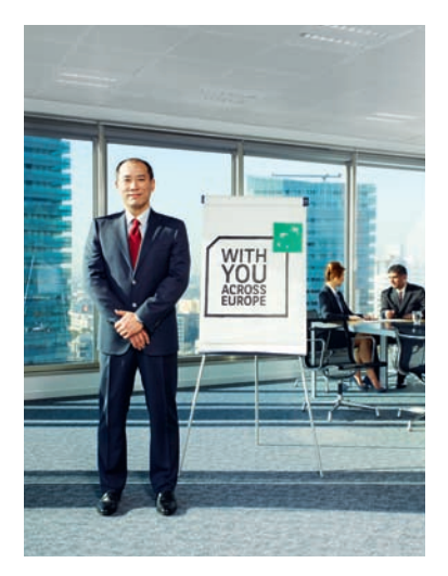
protect Pages 10/11