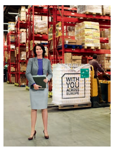
simplify Pages 6/7

To help your business reach its full potential across all markets, you need a corporate banking partner that operates wherever you do.