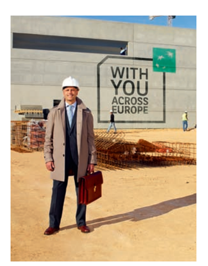
build Pages 8/9