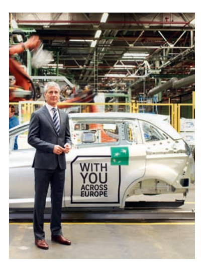
accompany Pages 4/5